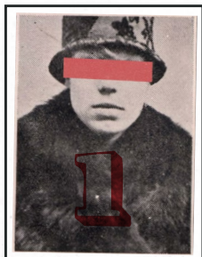
ALICE DIAMONDS ELEPHANT & CASTLE