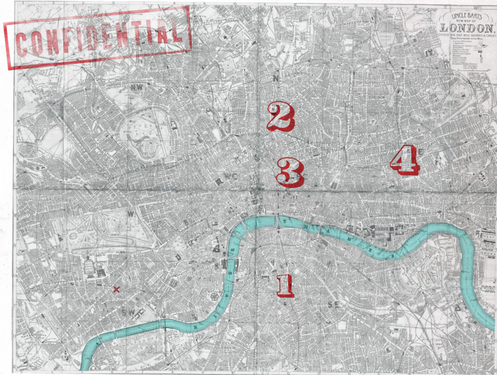
FIGURE 1: 1929 MAP OF KNOWN TERRITORIAL INFLUENCES

RECORDED: LONDON, 1920-35 | LOCATION: [REDACTED]